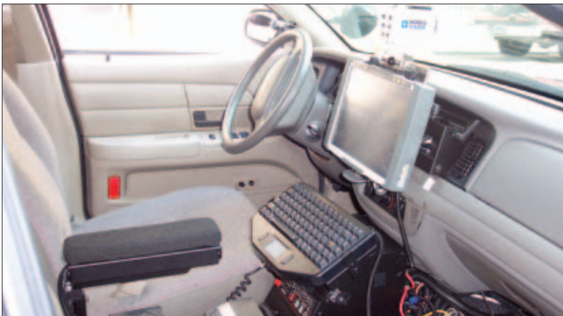
Independence Communications is currently installing 400 Xplore computers and modems in Cleveland police vehicles.